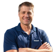
Ecolab's Performance Coach

A dedicated, in-person Performance Coach guides store leaders in data-driven strategies for operational improvement