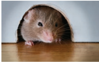
Mice can enter a building in an opening as small as ¼ inch.