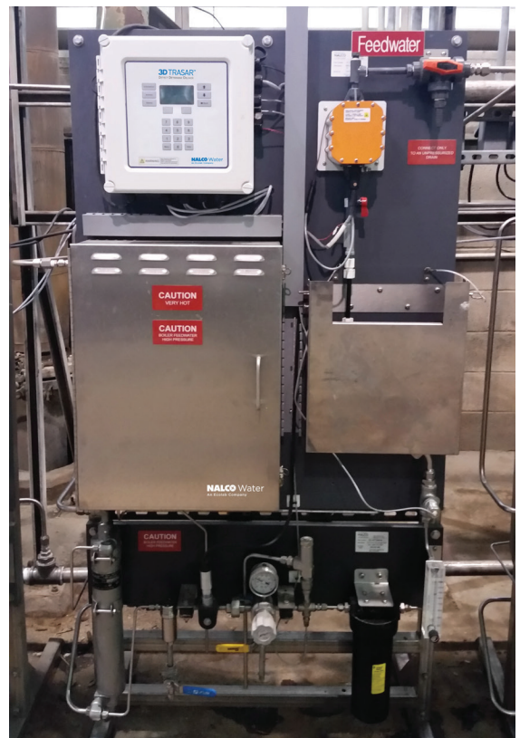
Figure 2. Nalco Water's Recovery Boiler Leak Indication Skid