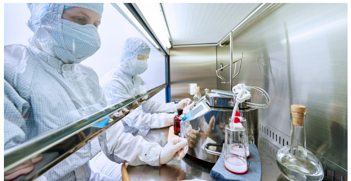
Gowned operator performing sterility testing in a laminar air flow hood

To reduce the risk of false positives, the sterility testing process should be performed in an aseptic environment. Historically, the common approach to achieve this was by performing the process in a biological safety cabinet (BSC) or laminar air flow (LAF) hood. However, this means the process is still open to the environment and operator, and thus there is still a risk of false positives occurring.